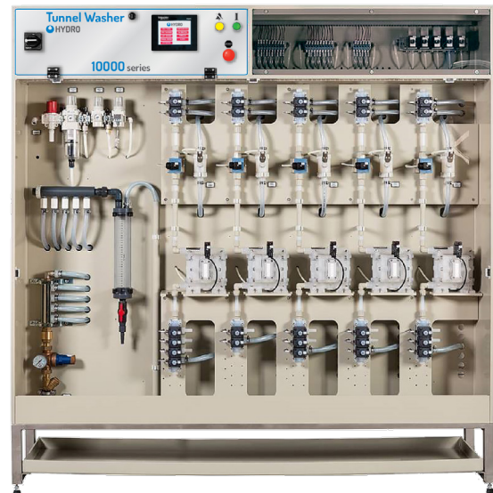
5-Channel Tunnel Configuration Model Numbers: HYDSPD0035 (US), HYDSPD0035M (Metric)

All Hydro Tunnel Washer units have the ability to communicate remotely through Hydro Connect. This means clients can access reporting information and make configuration changes remotely from any global location with an internet connection versus making costly site visits. Users report saving up to 90% in maintenance costs as a result.